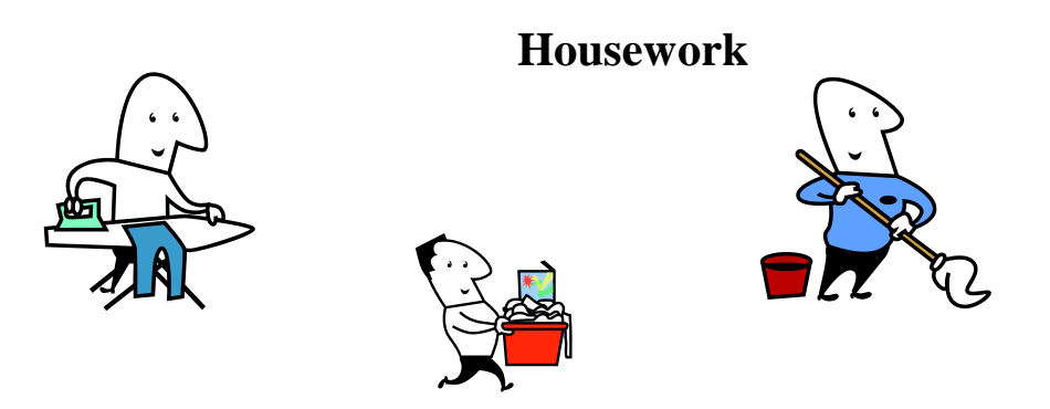
In New Zealand the housework is often shared by all members of the family, including fathers and brothers. Housework may include: making your own bed, putting out the rubbish, washing and drying dishes and preparing meals. You will be expected to help with these chores or offer to help when required.

Some host families will do your washing and ironing for you. Some may expect you to do it yourself. Check with your host family. Ask your host family how to use the appliances if you are unsure.